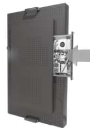
Pluggable CPU board