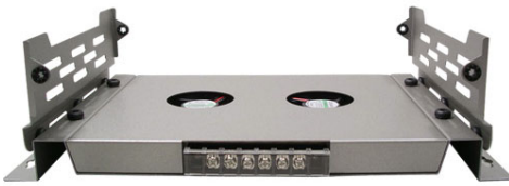
Fan-and Antivibration Kit