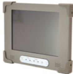
DeltaTerminal 8.4" for DeltaBox-PC Type Stuttgart II