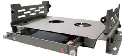
Smart Battery Kit