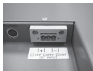
Phoenix-type power input