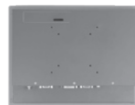
Various mounting ways Panel/Wall/VESA