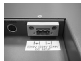
Phoenix-type power input