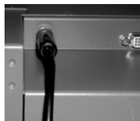
Screw-type power input