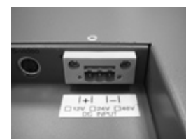
Phoenix-type power input