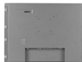
Various mounting ways Panel/ Wall/ VESA